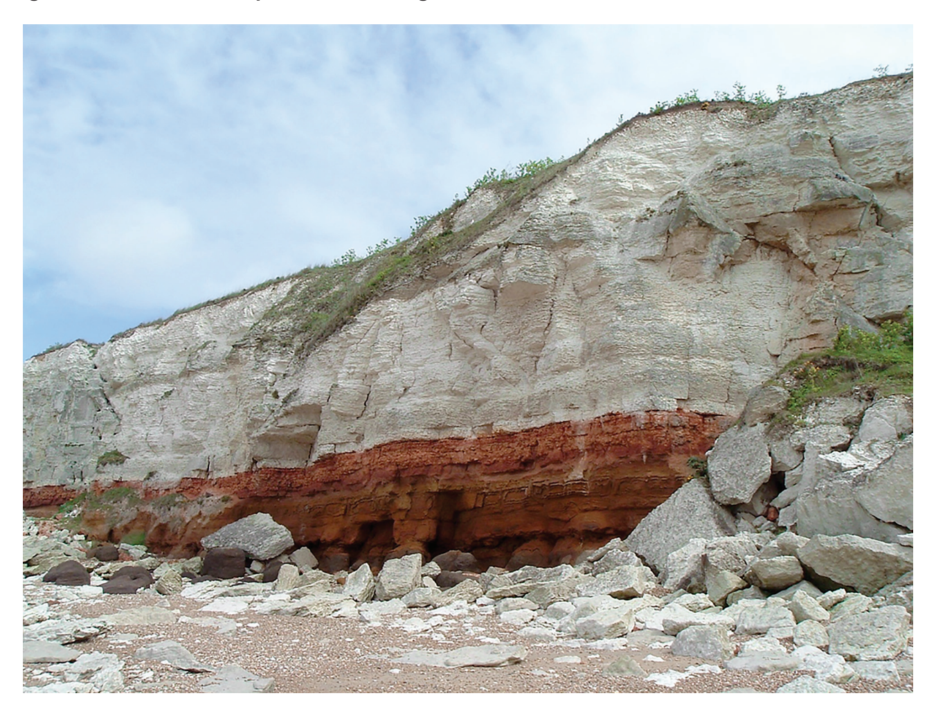
Fig. 1 – A coastal landscape in Norfolk, England